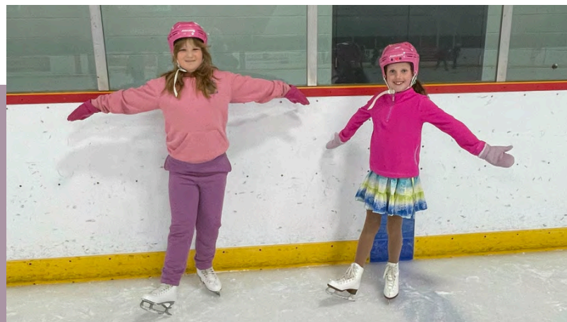
Two of our CanSkaters enjoying Mariposa Day Camp!